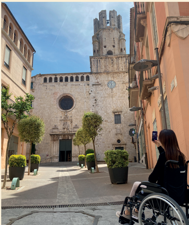
Historic Centre of Palafrugell