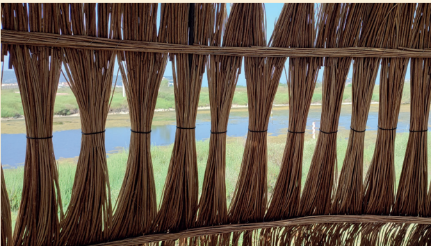
The Pletera itinerary