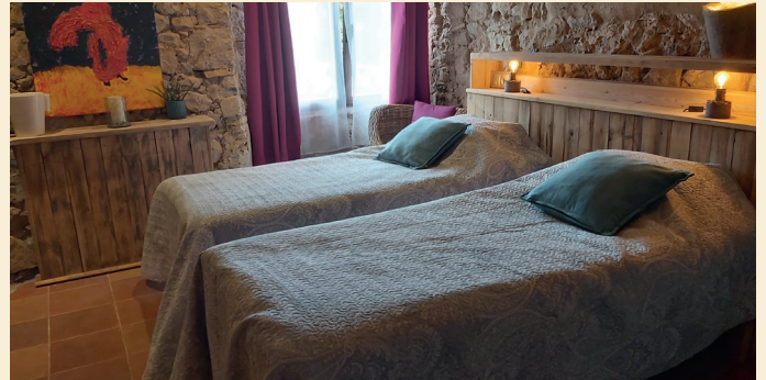
Mas del Llop Blanc