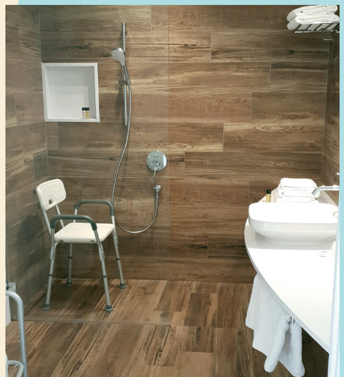
Hotel Can Miquel