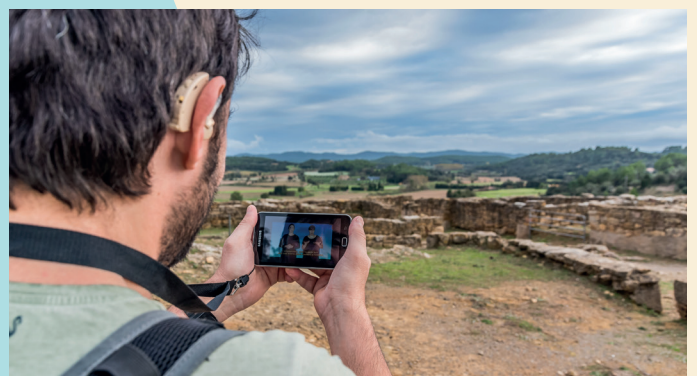
The Archaeological Museum of Catalonia – Ullastret