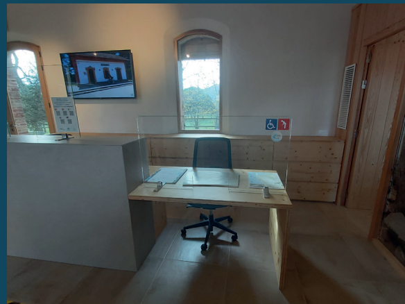
Tourist office of Santa Cristina d'Aro