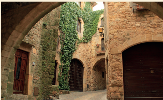
Historic Centre of Pals

FOR FURTHER INFORMATION VISIT THE WEBSITE