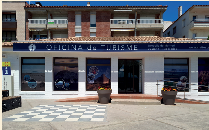
Tourist office of l'Estartit