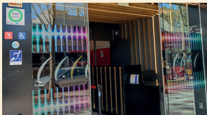
Magic Park gambling hall