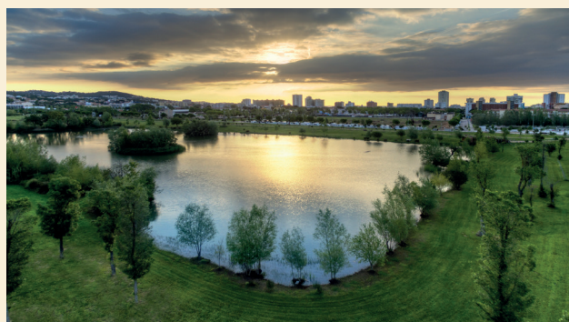
Parc del Estanys

FOR FURTHER INFORMATION VISIT THE WEBSITE