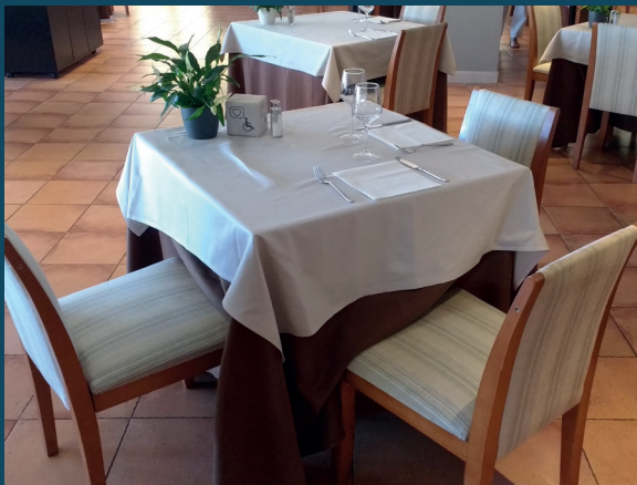
Hotel Ilunion Caleta Park

All the proposals below have been previously validated by a company specialising in tourist accessibility, and respond to the desire of companies and tourism organisations in the region, both public and private, to offer services and facilities better adapted for everyone. You will see that each proposal offers different amenities for different needs. The icons will help you see who each proposal is aimed at.