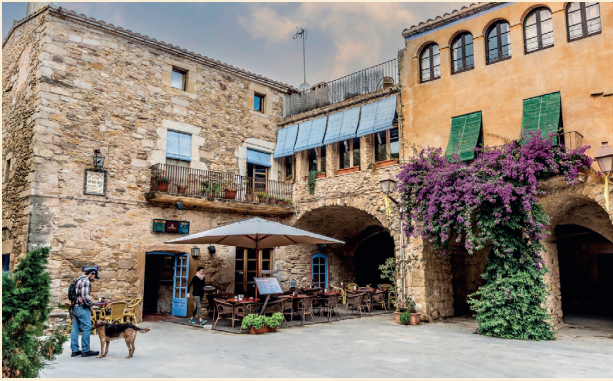
Historic Centre of Peratallada