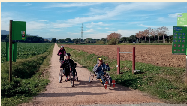
The Narrow – Gauge Railway Route